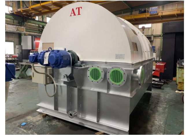
Rotating Biological Contactor